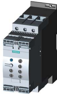
SIRIUS soft starter S2 72 A, 45 kW/500 V, 40 °C 400-600 V AC, 110-230 V AC/DC spring-type terminals