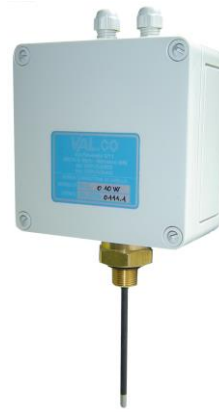
SLC .. 10