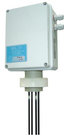
SLC .. 50