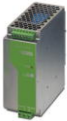
DIN rail power supply unit 24 V DC/5 A, primary switched-mode, 1-phase.

Please be informed that the data shown in this PDF Document is generated from our Online Catalog. Please find the complete data in the user's documentation. Our General Terms of Use for Downloads are valid ( http://phoenixcontact.com/download )