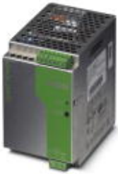
DIN rail power supply unit 24 V DC/10 A, primary switched-mode, 1-phase.

Please be informed that the data shown in this PDF Document is generated from our Online Catalog. Please find the complete data in the user's documentation. Our General Terms of Use for Downloads are valid ( http://phoenixcontact.com/download )