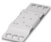
Universal wall adapter for securely mounting the power supply in the event of strong vibrations. The power supply is screwed directly onto the mounting surface. The universal wall adapter is attached at the top/bottom.

Assembly adapters - UWA 182/52 - 2938235