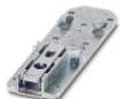
Universal DIN rail adapter

Assembly adapters - UTA 107/30 - 2320089