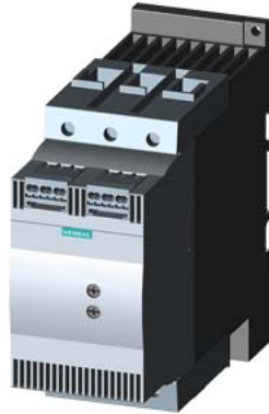
SIRIUS soft starter S3 106 A, 55 kW/400 V, 40 °C 200-480 V AC, 24 V AC/DC spring-type terminals