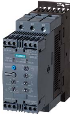
SIRIUS soft starter S2 72 A, 37 kW/400 V, 40 °C 200-480 V AC, 110-230 V AC/DC Screw terminals