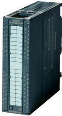
SIMATIC S7-300, Digital output SM 322, Isolated 16 DO, relay contacts, 1x 20-pole