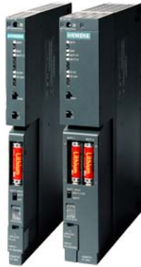
SIMATIC S7-400, power supply PS 405: 4 A, 24/48/60 V DC, 5 V DC/4 A,