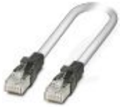
Patch cable, CAT5, assembled, 2 m

Patch cable - FL CAT5 PATCH 2,0 - 2832289