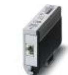
Surge protection in accordance with Class E A (CAT6 A ), for Gigabit Ethernet (up to 10 Gbps), token ring, FDDI/ CDDI, ISDN, and DS1. Suitable for Power over Ethernet (PoE+) "Mode A" and "Mode B". RJ45 attachment plug with separate grounding cable and ground connection snap-on foot for NS 35 DIN rails.

Surge protection device - DT-LAN-CAT.6+ - 2881007