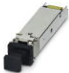
The small form-factor plug-in module provides a fiber optic interface with a data transmission speed of 100 Mbps with a wavelength of 1310 nm (long).