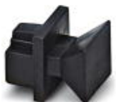
Dust protection caps for RJ45 socket

Dust protection - FL RJ45 PROTECT CAP - 2832991